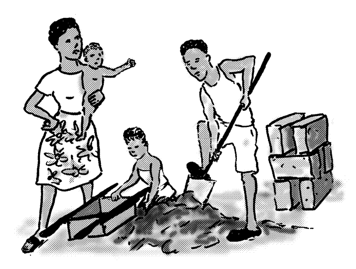
Traditionally the family worked together to support one another.

In traditional societies, where the family is still very important in the social structure, it is usually understood that this is the main unit that provides welfare services. Such provision is based on the pooling of all available resources within the social unit. Daughters tend to their sick and elderly parents, children work on the family farm or in the family business (particularly when they cannot find work elsewhere) and family members help one another, especially during the hard times associated with sickness and unemployment. When they are all affected, they tend to work together to support each other. This practice is more prevalent in some cultures than in others.