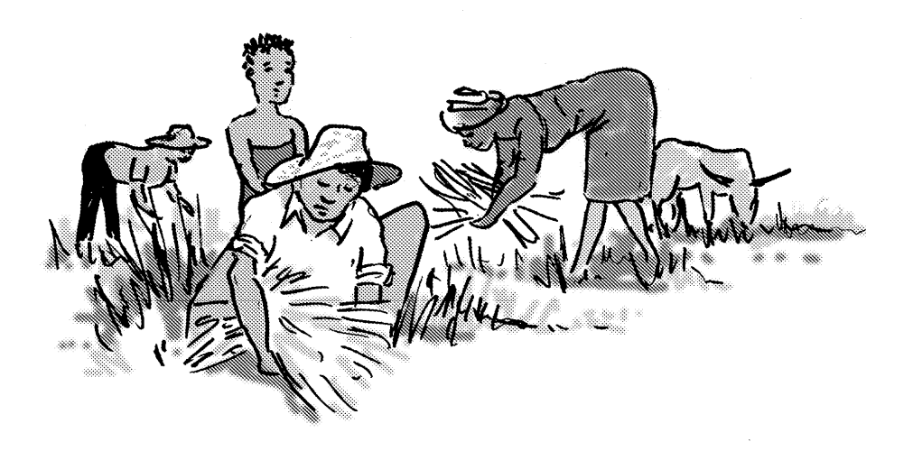
Traditional, pre-industrial work methods.

During the 15th and 16th centuries, a number of significant social and economic developments occurred, namely, population movements, changes in agriculture and the growth of manufacturing towns. These developments all meant that the support that had been provided by the family was no longer as easily accessible. In other words, people had to become more self-sufficient within a much smaller unit than the traditional extended family. So when people fell on hard times, they had to look for other means of support. The church and other religious orders became significant players in providing social / welfare services.