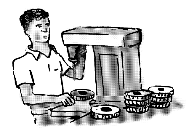
Modern, factory-based work methods.